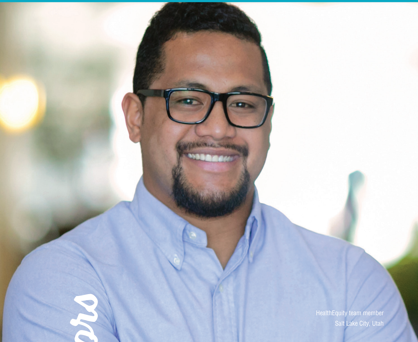
HealthEquity team member Salt Lake City, Utah